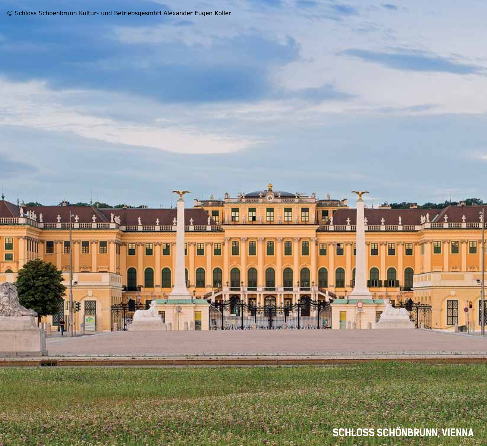
SCHLOSS SCHÖNBRUNN, VIENNA