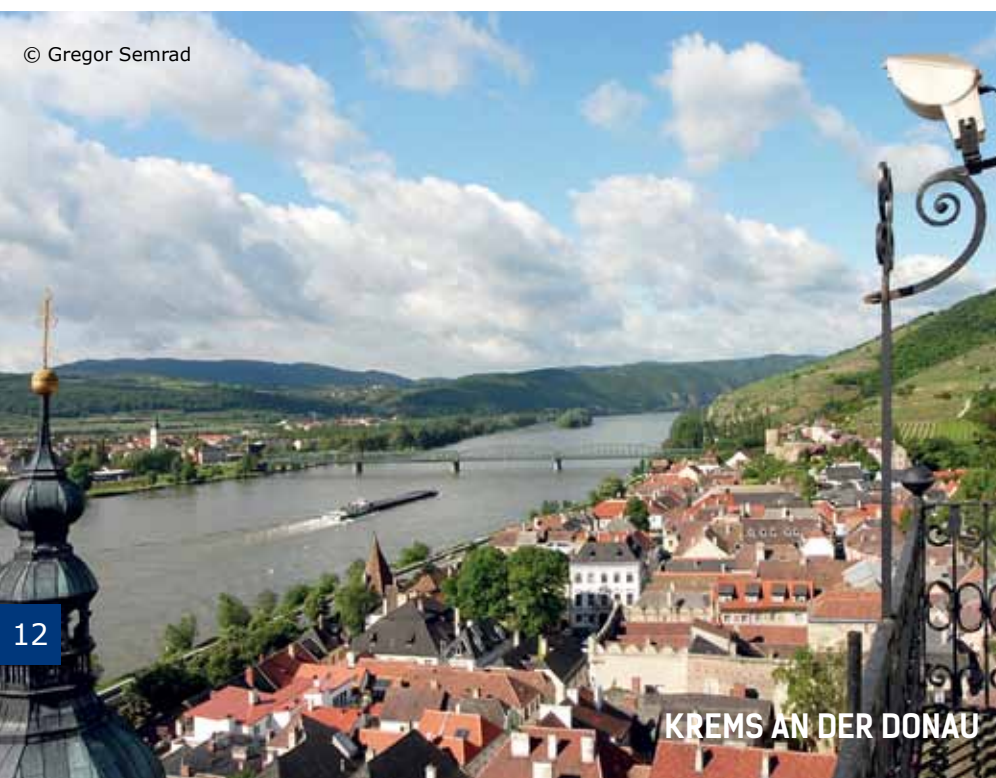
KREMS AN DER DONAU

* The excursions may be subject to change due to unforeseen circumstances.