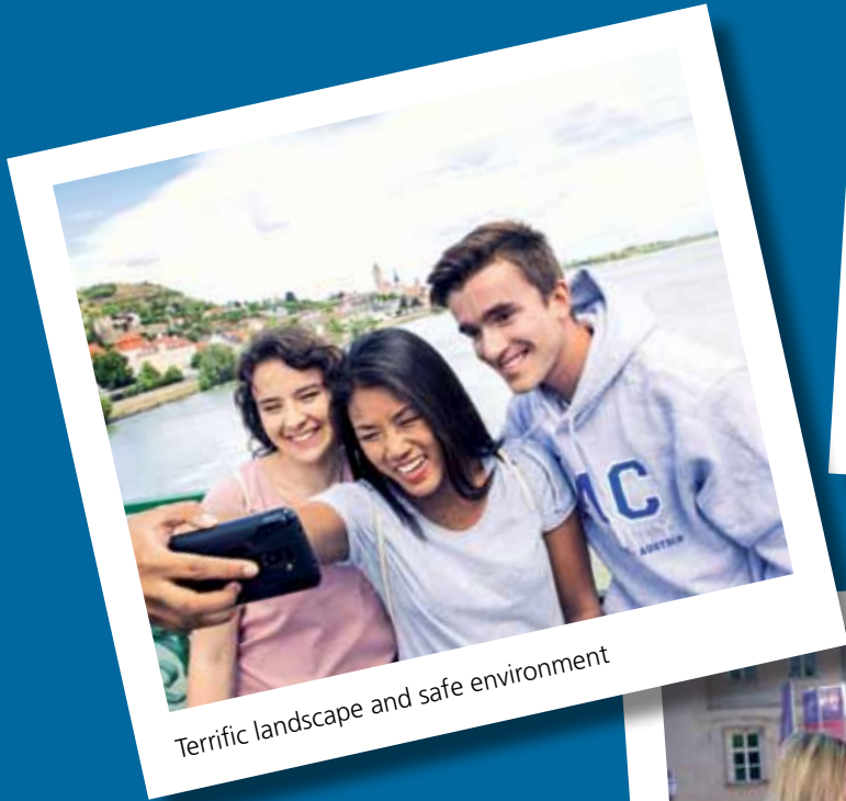
Terrific landscape and safe environment